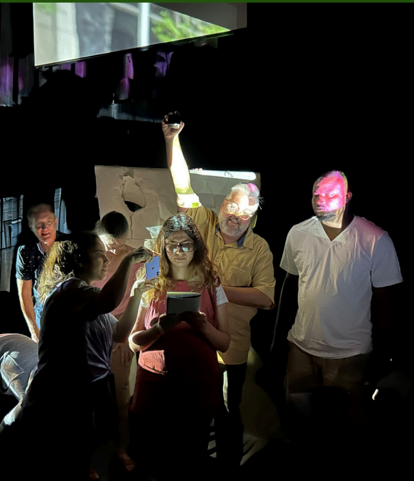
DURING METABOLISM: A HAPPENING

What is the biggest takeaway from your research/work?