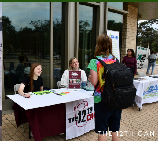
THE 12TH CAN