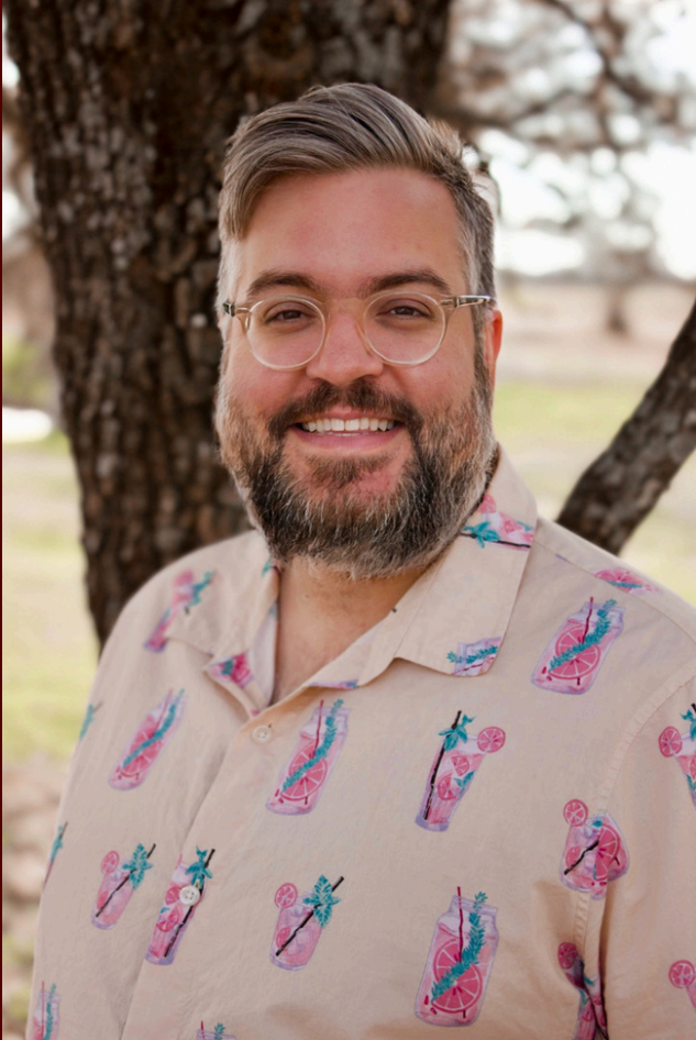
Academy for the Visual & Performing Arts